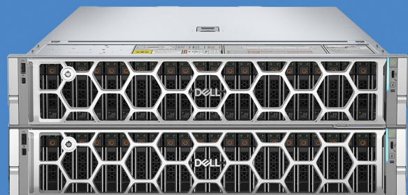
Dell PowerEdge R7725 / R7725xd