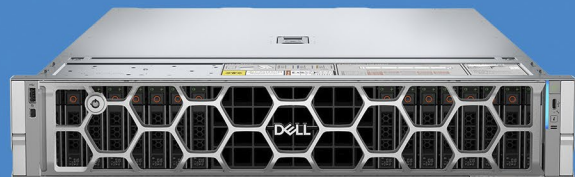
Dell PowerEdge R7715