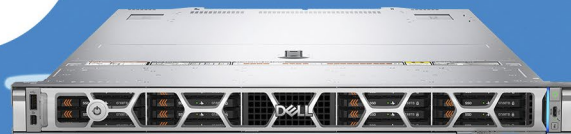
Dell PowerEdge R6715