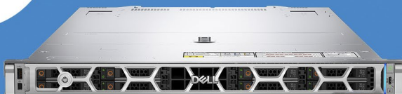
Dell PowerEdge R6725