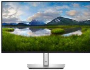
Dell Pro 24 Plus USB-C Hub Monitor - P2425HE

Stay connected to productivity with this FHD hub monitor, designed to deliver both performance and comfort. Certified by TÜV for 4-star eye comfort, it ensures enhanced visual comfort during extended use. Additionally, it offers up to 90W of power delivery, making it a versatile solution for powering your devices.