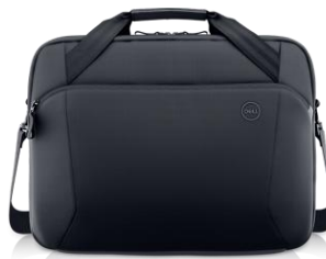
Dell Pro 15-16 Plus EcoLoop Slim Briefcase - CC5624S

Collaborate confidently with this 2K QHD webcam that's essential for everyday use.