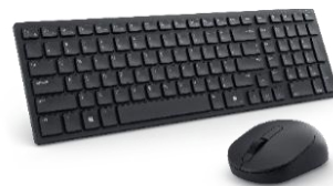
Dell Pro Compact Silent Keyboard and Mouse - KM555

Stay connected to productivity with this FHD hub monitor, designed to deliver both performance and comfort. Certified by TÜV for 4-star eye comfort, it ensures enhanced visual comfort during extended use. Additionally, it offers up to 90W of power delivery, making it a versatile solution for powering your devices.