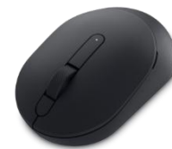
Dell Pro Compact Silent Mouse - MS355

Designed for on-the-go productivity and protection, this slim briefcase is made of eco-conscious material to complement any lifestyle.