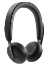
Dell Pro Wireless Headset - WL3024

Work quietly in any space with a compact, silent keyboard and mouse combo that connects seamlessly with dual-mode connectivity.