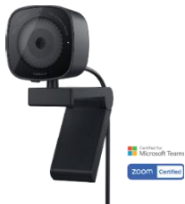
Dell Webcam - WB3023

Experience uninterrupted communication with this wireless headset featuring an AI-based noise cancellation microphone, designed with productivity and comfort in mind for all-day conferencing.