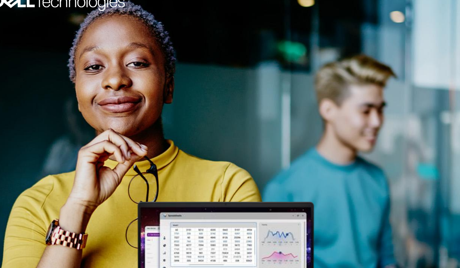
Dell Pro Essential 15 (PV15265)